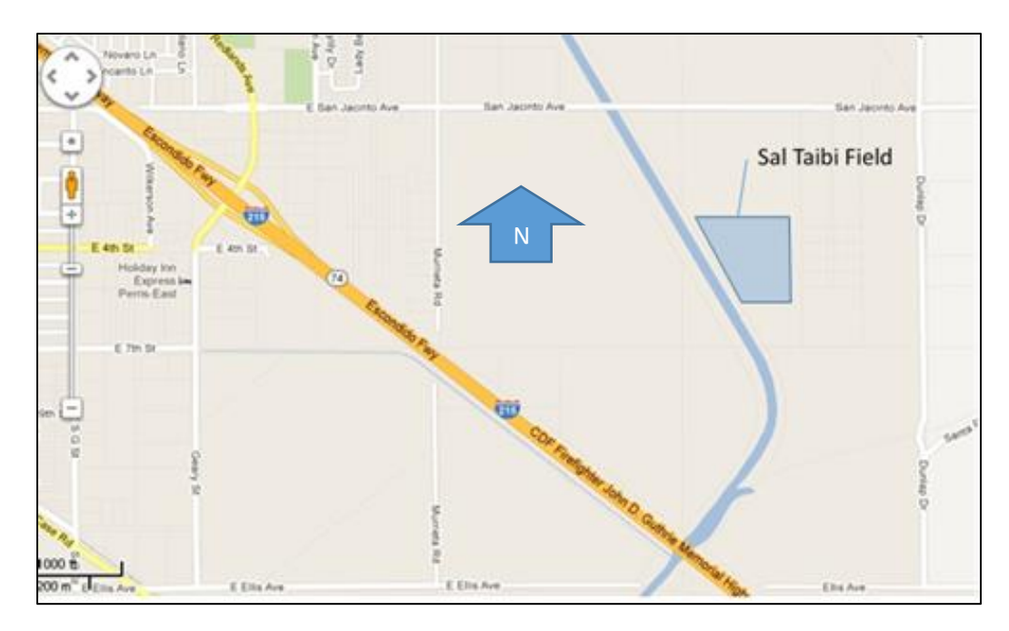
Note to guests interested in observing or flying free flight models at Perris:

The usual time to catch us in the act is in the morning. Most Saturday mornings are when people come out to test fly or tune up their models and skills, and just have a good time. You can observe the Southern California Aero Team (SCAT) FAI rubber and glider flyers along with with others flying a range of model types-mostly endurance rubber powered and electric or gas powered. Scale free flight models are flown when the San Diego Scale Staffel has their FAC contests-check their website for schedules. These are typically conducted over two day periods to get in all the event categories normally flown. Flying usually starts 7-ish and ends late morning depending on winds. There is a larger group that flies on Wednesday as well if you would rather make a mid-week trip.